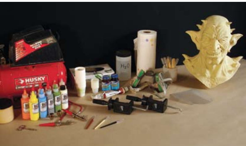
Some of the supplies you will need to paint your mask

6. One of my favorite painting techniques is the rubout method I learned years ago. For that, you'll need a container of rubber cement. Transfer a 4 oz. bottle into a plastic container. Oh, and by the way—rubber cement uses a nasty solvent, so be sure to wear gloves and use a proper vapor filter mask to protect yourself.